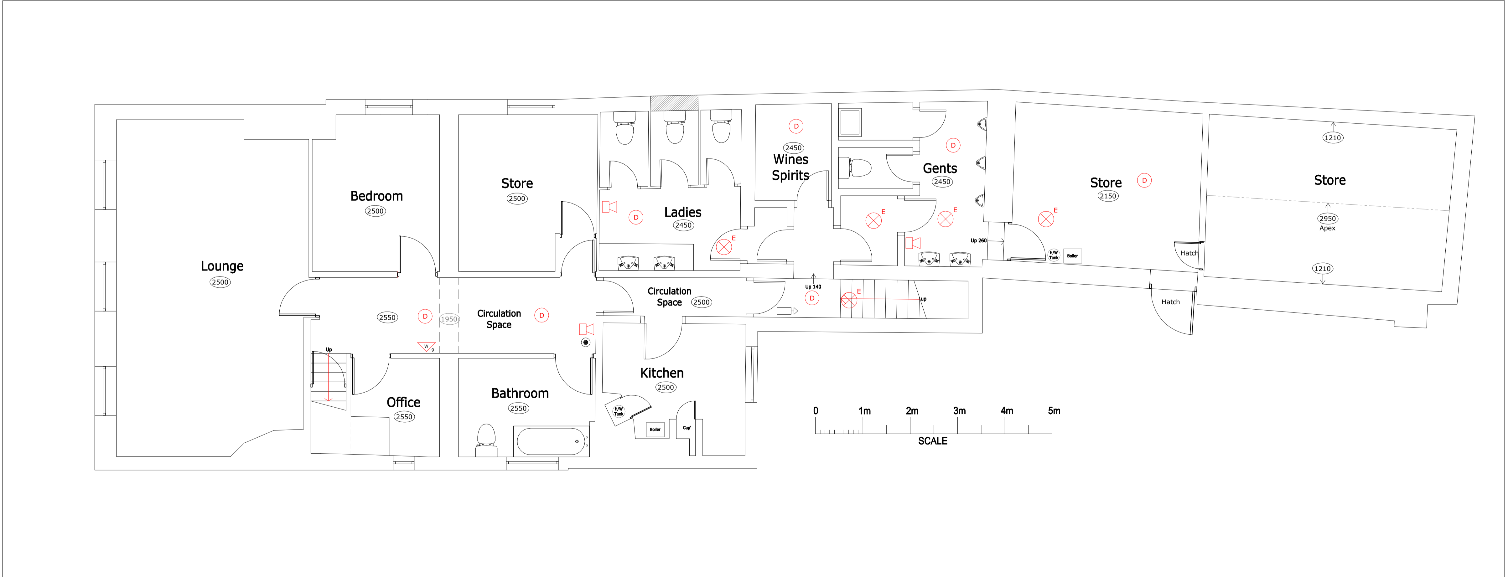
Plan of First Floor 1:50